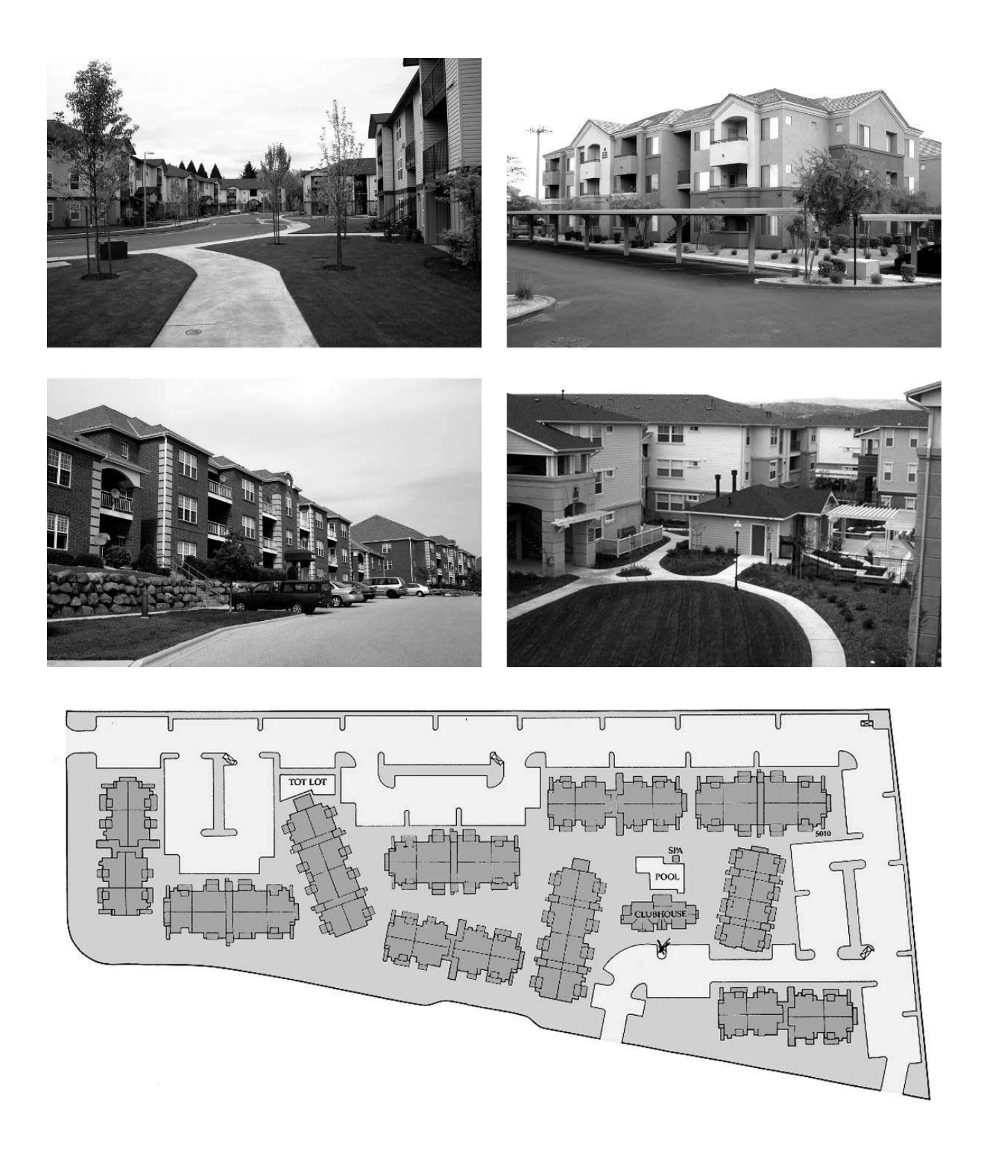
Figure 1: Typical Suburban Multifamily Housing Designs. (Clockwise from upper left: Eugene, Oregon; Phoenix, Arizona; Pleasanton, California, typical plan from Pleasanton, California, and Sun Prairie, Wisconsin)